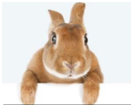
Senior vs Geriatric?

As our understanding of rabbit health requirements and general husbandry have grown, more senior and geriatric rabbits are seen. 12